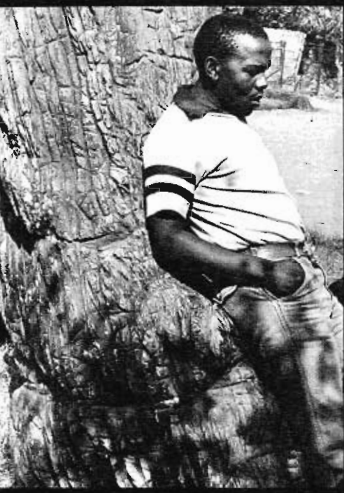
▲ The artist leans against a large, roughly carved rock outside his home. He brought the rock to Katlehong by truck.

"This year, I have been invited by the African Arts Gallery in Washington DC to visit the States. I'll start exhibiting in San Fransisco, then on to New York City before going on to Washington. They only want bronze pieces. They'll pay my air fare as well as other