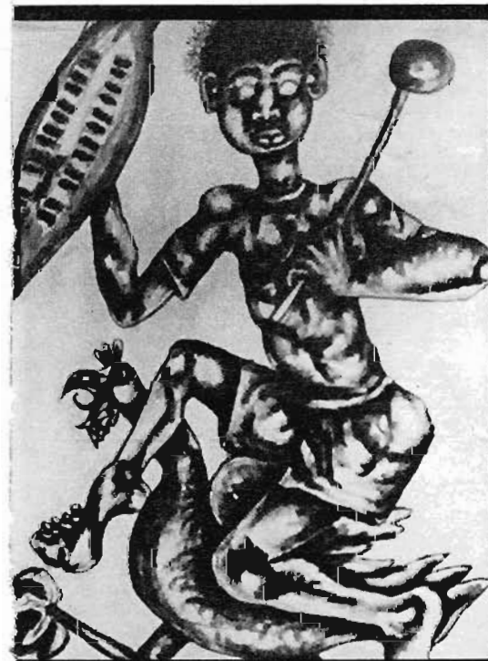
▲ Another drawing by Stanley called The Herdboy .