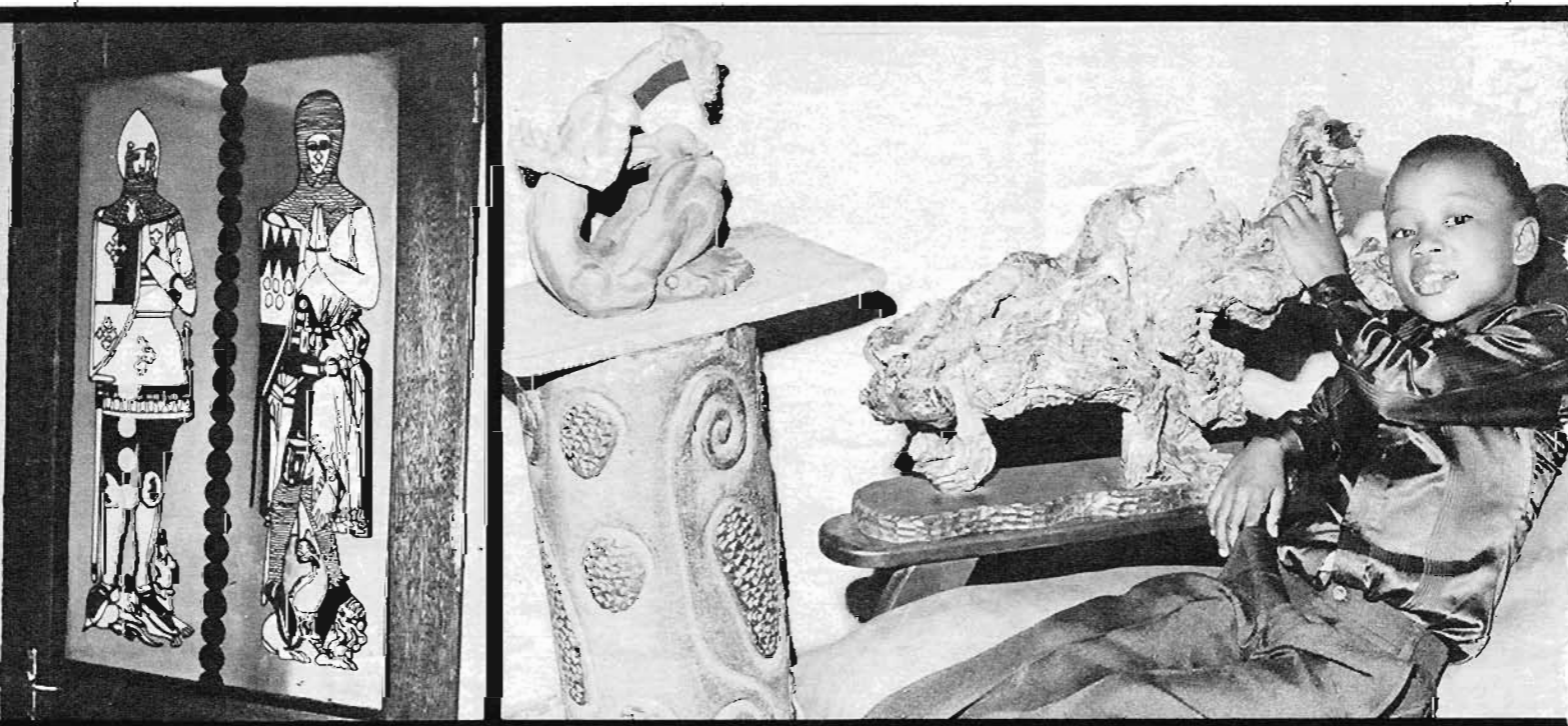
▲ Stanley's two paintings called The Warriors are on the glass portion of a door dividing the lounge from the kitchen in his home.

The following day, he met up with two women who had seen him on