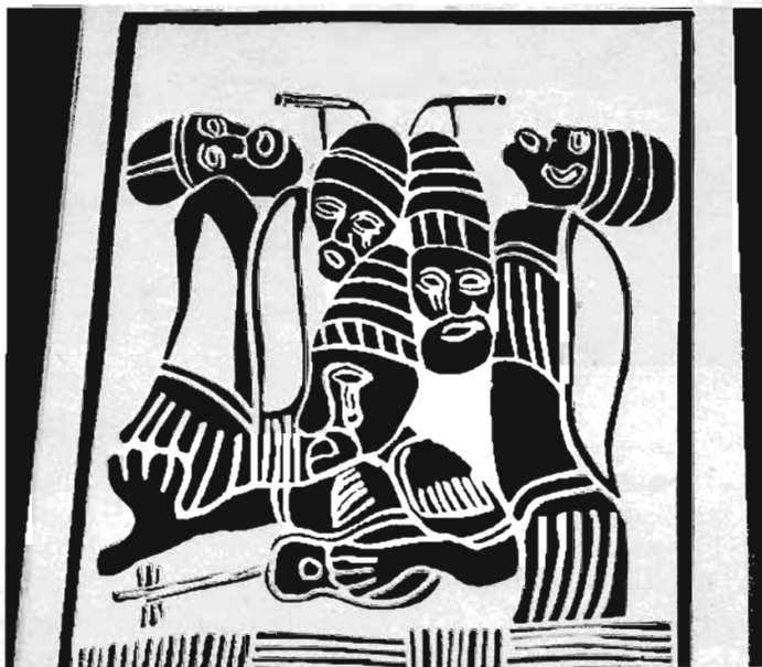
A lithograph (drawing) hanging in Stanley's home. It is one of his earlier works and has no name. ▶

"You'll see what I turn out of it once I get started!"