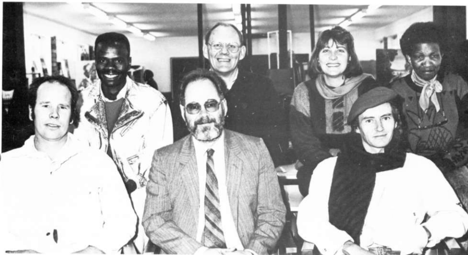
Front row, left to right: