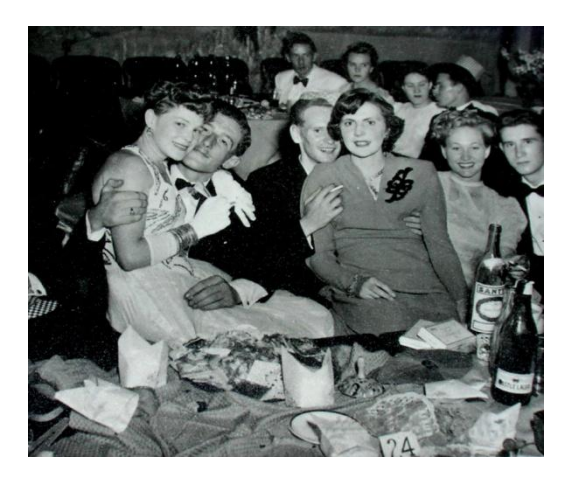
Dance Springs in 1949

During the late 1950s/early 1960s, she was very involved with the Springs Repertory Theatre, Springs, particularly in set design and creation.