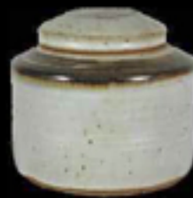
Vessel with lid Stoneware