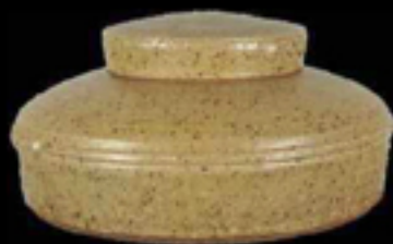
Dish with lid Stoneware