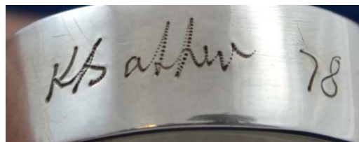
"Choker" in ivory and tiger's eye set in silver, with signature etched at back into the silver piece, 1978 – acquired by first owner in South Africa 1978/79