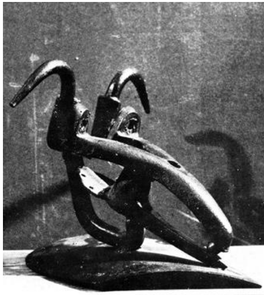
"Crânio" sculpture in wrought iron – 25 cm H – cat. 24