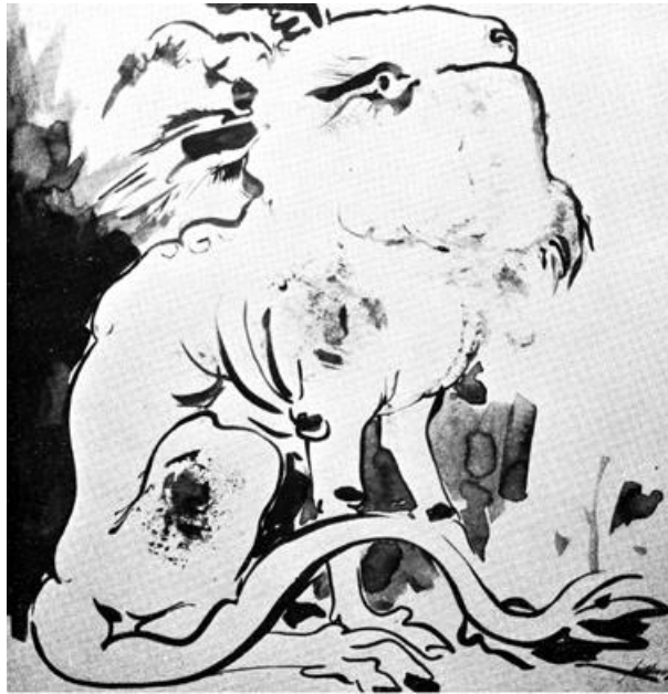
"Desenho I." watercolour 49x48 cm- cat. 21