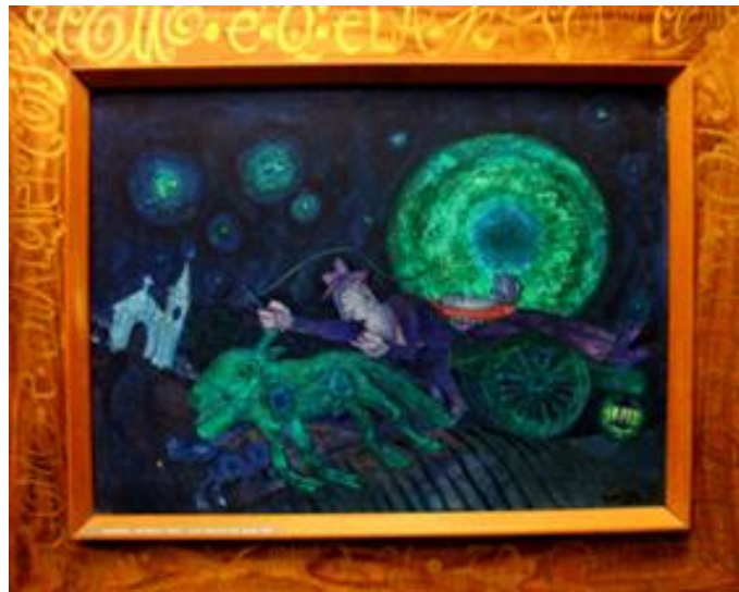
"The dead one", 1965 – oil/canvas 55x75 cm – signed on back Antonio 6/65