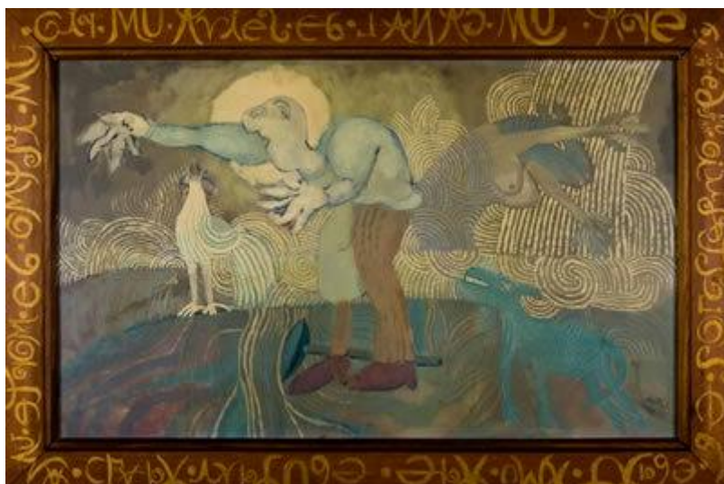
"São Macêtas, ferrador e mártir e os fantasmas da cachoeira", 1956 – acrylic/wood – 80x130 cm - cat. 16

See http://www.za-ch-art-kunst.ch/ARTLinks/PrivateCollection/QUADROS_Antonio.htm