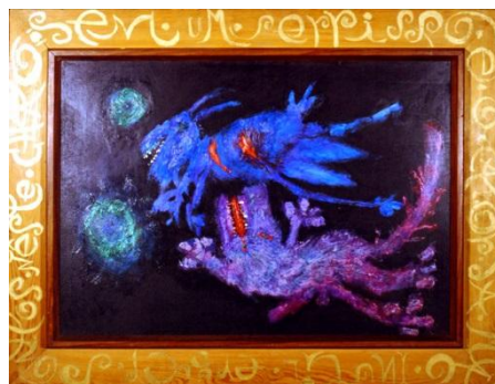
"Homenagem aos poderosos", 1966

See http://www.za-ch-art-kunst.ch/ARTLinks/PrivateCollection/QUADROS Antonio 2.htm